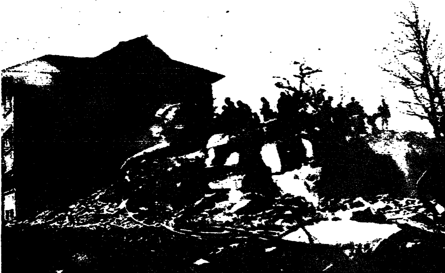
QUAKE AFTERMATH -- Rescue workers feverishly work to clear the debris of collapsed houses in the industrial town of Ploiesti, some 90 kms north of Bucharest and much closer to the epicentre of the disastrous earthquake that hit Romania Friday night.